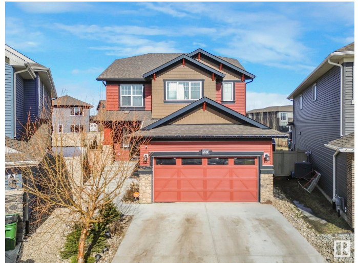
2539 Orchards Way SW, Edmonton, AB

MLS® # E4427515 Price $850,000 Bedrooms 6