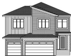
Mirage II - Prairie Modern