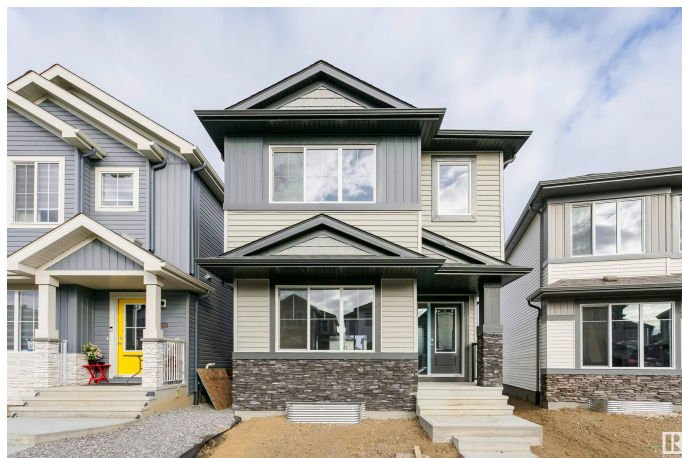
9530 Carson Bend SW, Edmonton, AB

Main Floor Exterior Area 74.32 m 2 Interior Area 68.37 m 2